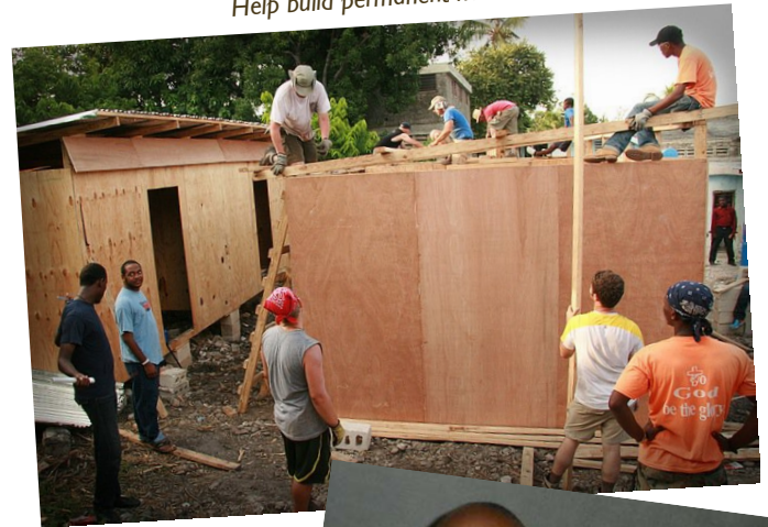
Help build permanent homes

PREPARATION: As soon as Forward Edge receives completed applications, we'll send you a team pack: T-shirt, training materials, packing list and information about Haiti. Please note: FEI strongly recommends that each team member checks with his or her doctor before embarking. We are currently requiring that each team member have a prescription for Cipro and also brings Rehydration Salts and Electrolytes with them. We also recommend current shots for Tetanus and Typhoid and medication for Malaria. Team members may also want to consider vaccinations for Hepatitis A & B, Meningitis or H1N1. Again consult with your physician for the most up to date immunization recommendations.