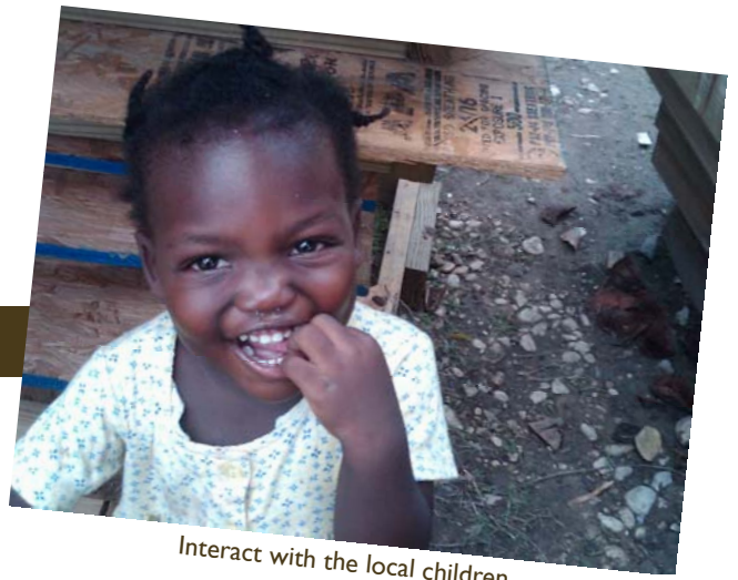
Interact with the local children.