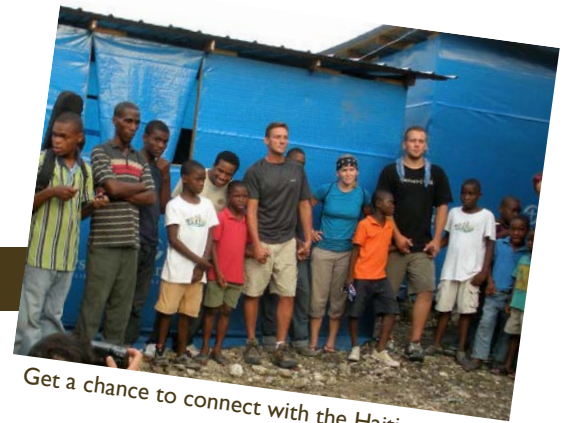
Get a chance to connect with the Haitian people

WHAT WILL WE BE DOING? Teams will be given the opportunity to serve in a variety of ways, both relationally and physically. The need in Haiti is great, and teams should expect to do anything related to disaster relief and protecting and encouraging vulnerable children. Projects will be determined on a variety of criteria, but the primary deciding factor will be going where the need is greatest.