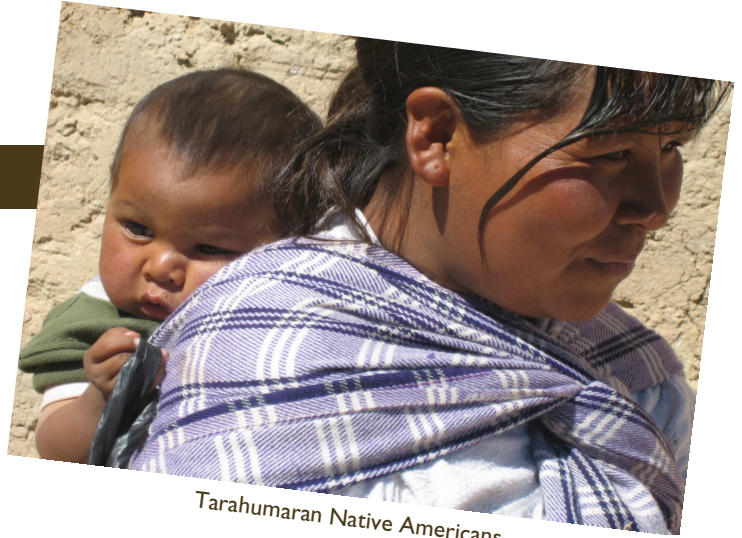
Tarahumaran Native Americans