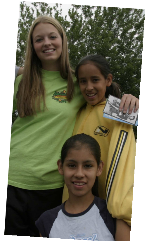
Build relationships and work along side the local people

Once Forward Edge receives completed applications, we'll send you a team pack, which includes a T-shirt, training materials, and details on what to pack.