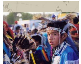
A young boy at Crow Fair

Each August, approximately 25,000 people gather for the Crow Fair celebration, a family reunion of dancing, singing, parades and a rodeo. As the sound of the drum begins, men, women, and children, adorned with magnificent regalia, dance to the customs and traditions of the past and present. There will be many opportunities to share the love of Jesus as you participate in Crow Fair..