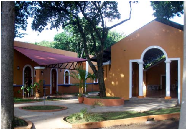
Villa Esperanza, team homes and the rancho

Whether hugging a child at the dump school, visiting babies and children at the local orphanages or assisting the laborers at the Village of Hope, there will be a vast array of opportunities to help and to demonstrate God's love to the people you meet in Nicaragua. It will be an amazing experience for each one of you.