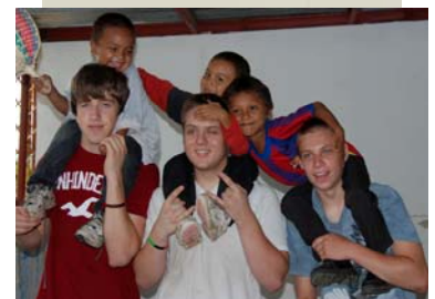
Build relationships with the vulnerable children in Managua!

Everyone should have an opportunity to change a LIFE.