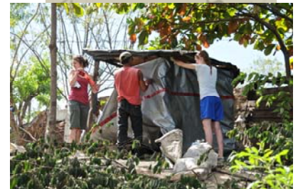
Serve those living in La Chureca, the city dump.