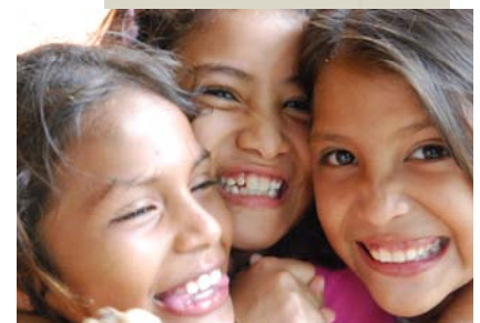
Meet the girls living at Villa Esperanza!